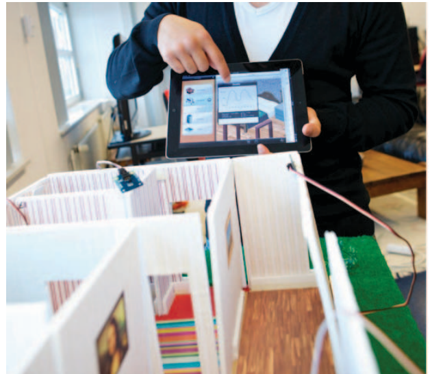
Figure 2. Interactive tools for exemplifying sensor monitoring: iPad application and first version of the interactive dollhouse (with visible sensors)

For democratically engaging the elderly as end-user, interactive tools were developed to demonstrate and explain the workings of the proposed monitoring system and the sensor activity output (see Fig. 2). Namely, an interactive dollhouse and iPad applications displaying live monitored sensor activity data were developed that target the elderly user.