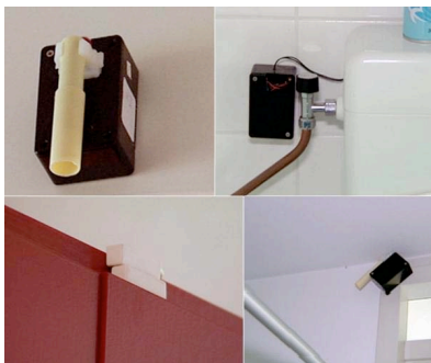
Figure 1. Sensors installed in the homes of the elderly participants