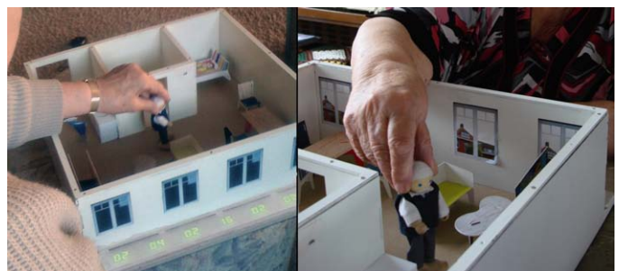
Figure 3. The interactive dollhouse (latest version with hidden, embedded sensor technology and direct display)

Sensor-equipped dollhouses were developed for increasing people's understanding of the existence and desired workings of ambient monitoring technology in the home by demonstrating its potential (see also [8]). The dollhouses, scale models of the different sensor-equipped homes, were developed and used to engage elderly users in residential monitoring. The scale models have been equipped with simple sensors that are able to track movement and so simulate the actual monitoring environment. The models were used as an elderly-centered research and design method in different settings for increasing understanding of the desired workings of ambient monitoring in the home.